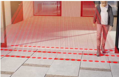
Uniform Sensitivity ULTI-SHIELD Technology